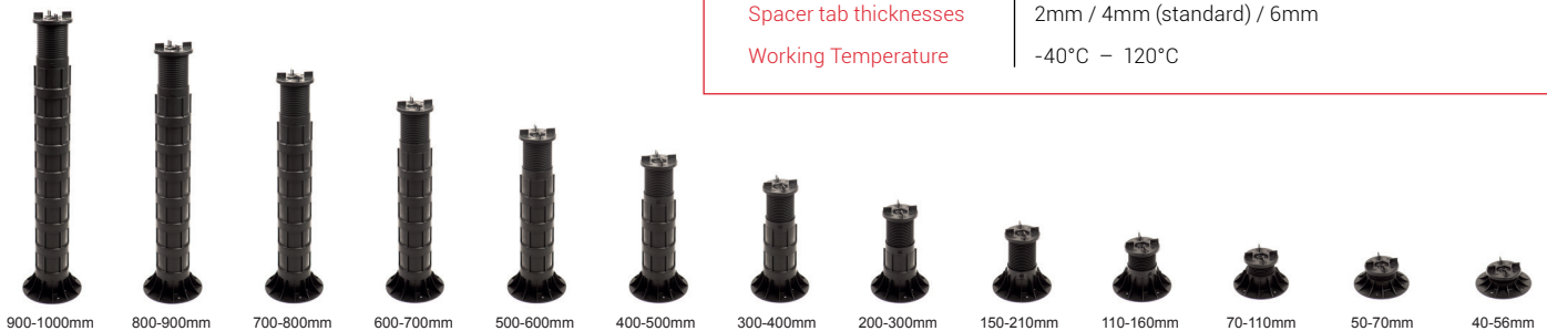
Base Diameter 220mm